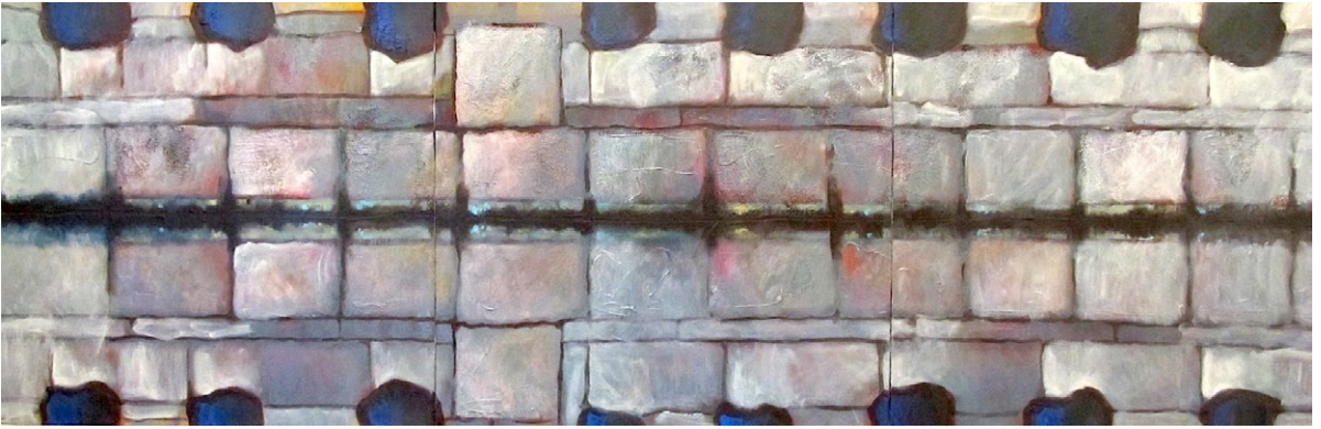
Your Brutal Boundaries , 2014, Acrylic/canvas, 51cm x 153cm triptych

Yet another series of repeating patterns. The massive slabs of concrete along Anderton Road, heavy and grey and monumental, holding in the water below. On the boulevard above, a final touch of repetition -- trees regularly spaced, like soldiers in a line.