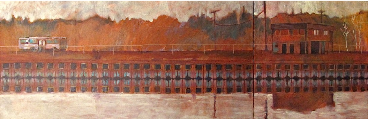
Long Road to Comox, 2014, Acrylic/canvas, 61cm x 183cm diptych

Looking from the Riverway. The #4 bus making its way along Dyke Road. Visually, I love the tension of the long space between the bus and the abandoned building. Emotionally, I think of people separated by distance, making their way toward each other.