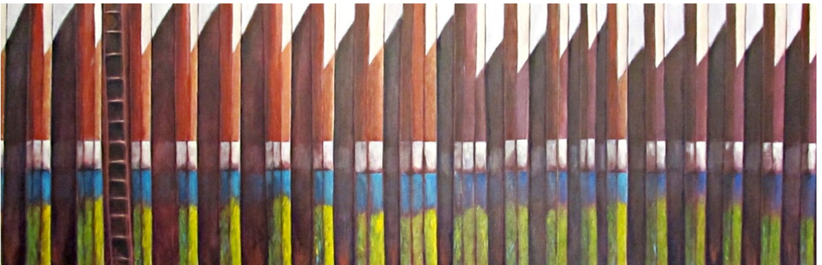
Corrugation , 2014, Acrylic/canvas, 61cm x 183cm diptych

Eventually sated by the industrial ambience of the city, the port, and the railyards, she spent some time in Texas, recharging her colour sense, then settled in Courtenay, where she continues to explore the human imprint and the structures we have created around ourselves.