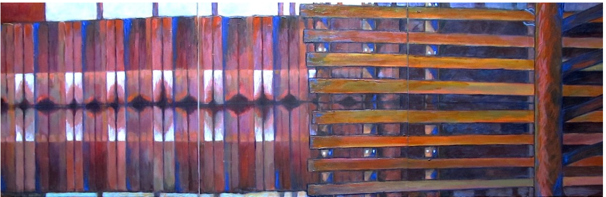
Tideline, 2014, Acrylic/canvas, 51cm x 153cm triptych

The priority is on the visual impact of human construction where the water meets the land. My interest is in the forms and patterns created by such structures, giving the river a canal-like appearance. Emphasis is on the geometry created by the linear structures and the tidelines, doubled by their reflections in the water, the style is contemporary realism.