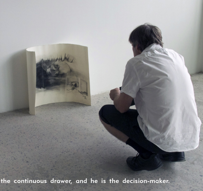
There are two figures in a large empty space: she is the continuous drawer, and he is the decision-maker.