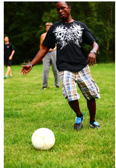
Ron Pogue, Barnabas' Hand , 2013, Photograph, 76.2 cm x 51 cm Barnabas effortlessly approaches to deliver the decisive kick.