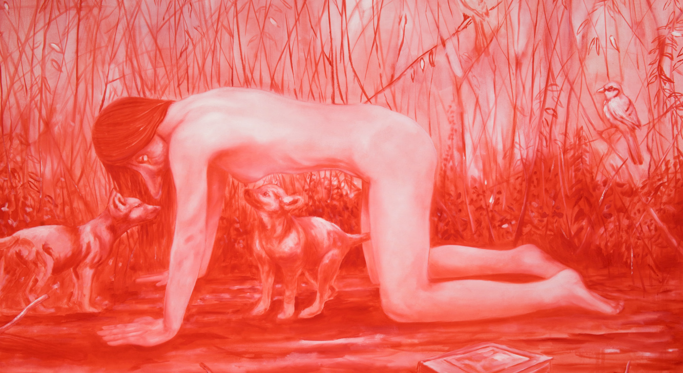
JW All Tomorrow's Parties — Mother , 2017