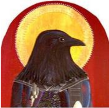
Saint Virginia (Patron Saint of Métis Women) Elaine Savoie acrylic on board 2011